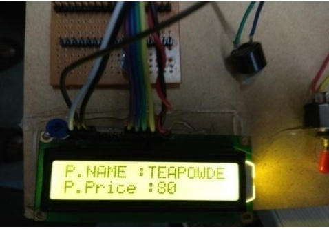
Fig. 3. Product Details Displayed on LCD

After scanning the product the product details will be fetched from the database and will be displayed on the LCD as shown below.