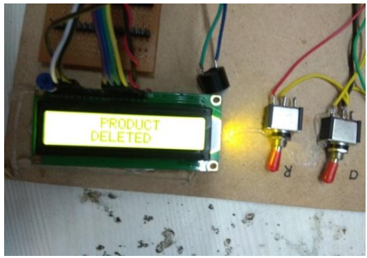
Fig. 4. Message Displayed on Removed Product

When the product is deleted the information of the same product will be deleted in the billing database and displayed on the LCD as shown below.