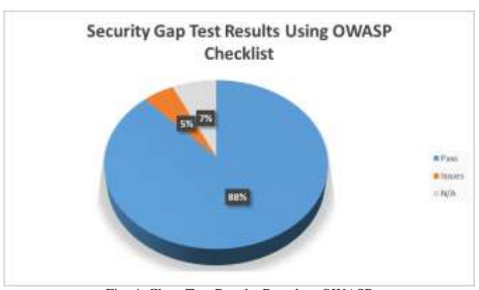
Fig. 4. Chart Test Results Based on OWASP