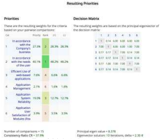
Figure 3. Priority Attributes and Decision Matrix

Here are the results of weighting for each attribute based on pairwise comparisons and their decision matrix: