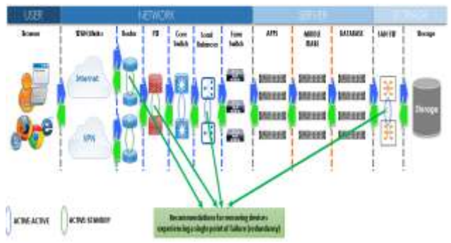
Fig. 2. Recommended device architecture

It is expected that the device architecture conditions suggested for PT. XYZ in order to be able to provide with the concept of Redundancy (High Availability), are as follows: