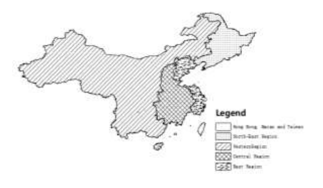
Fig. 1. China map.

temporal and spatial evolution characteristics of socialecological resilience in China through the linear weighting method and grey correlation model to find out the main factors affecting China's regional social-ecological resilience. Therefore, it will provide some useful and helpful references for the construction and assessment of China's resilient cities under the background of climate change.