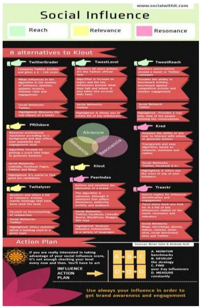
Fig. 3. Social influence and word of mouth publicity.

has markedly increased the speed in which messages are shared in social networks. At the same time the cost is often found to be much lower than that of other forms of marketing and the ROI better.