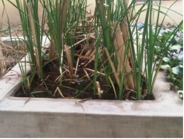
Day 10 Fig. 5. Typha orientalis (cattail) exhibiting a stress- tolerance functions with increasing treatment periods.