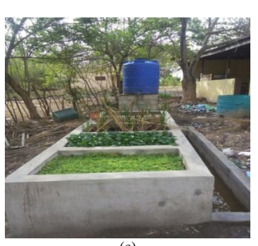
(c) Fig. 1. Wetland Units Construction: During, after and vegetation growth in constructed wetland.