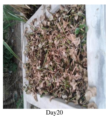
Fig. 4. Eichhornia crassipes (water hyacinth) withering and drying with increasing treatment periods (Days 5-20).