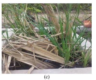
Fig. 2. Vegetation growth before treatment: a. twelfth day after planting; b and c. week six after planting.