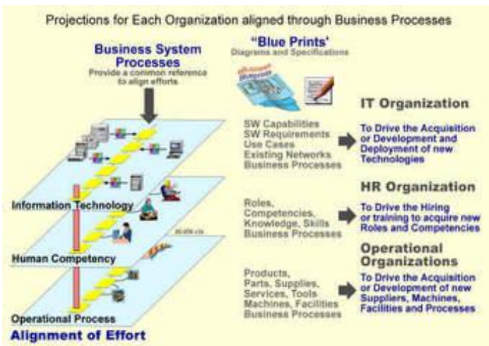
Fig. 4. Business transformation process.

With disruptive change becoming the norm, many government departments and agencies are looking to transform their business models to meet changing demands. Ideally though, an organization should be pre-empting rather than reacting to those changes. We need to develop business transformation strategies that tackle disruptive forces head on – turning risks into opportunities and issues into benefits. Business Transformation solutions will help you adapt, redesign, and or align your business model, workforce, culture, technology, and business processes to achieve the outcomes you want and need. Although we see all aspects of an enterprise holistically, we are able to focus on specific aspects if needed – be it internal operational pressures, machinery of government changes, adoption of newer technologies, or citizen expectations of digital services.