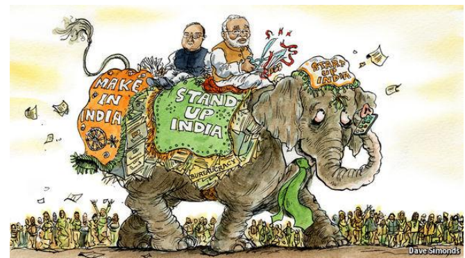
Fig. 1. Though the pace of change is not what Narendra Modi (PM) promised, he has been lucky with the economy.

While the Government is doing everything to make easy doing business with India, we as citizens and members of an organization have responsibilities to realize the dream. While reforms by Government can help us improve our Performance as an organization productivity and skills improvement is an individual agenda item. While transformations through reforms is a gate way we need to make use of it by improving individual performance and better understanding of what is needed in the current situation. As responsible members of an organization and as public we have this responsibility. The present article and research paper is about how individuals can affect this change!