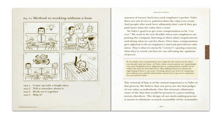
Fig. 5. A page from the employee handbook of valve software company.

Organizations that want to embrace employee empowerment may want to begin by creating written empowerment guidelines. It's also important to offer employees ongoing training so that they're prepared and capable of resolving any customer issues. Truly empowering employees is about granting them freedom to build genuine customer relationships and to create memorable moments for your customers. Your company handbook allows you to navigate not only your business' policies, but also your brand and your company's vision. While the idea of a "handbook" often conjures up a jumble of technical jargon and rules to follow, writing one is really a chance to express how your company thinks about culture, how you treat your team, and how you celebrate success or endure hardships together in a credible and simple language. The handbook is a place to communicate the values that bind you together and keep you on the path of true north. (See figure 5, below)