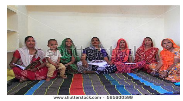
Fig. 1. "Jaipur, India - February 25, 2015: Women visiting center for women empowerment".

success and better performance. But the mute question is whether has been a positive correlation between the measures and the results and whether the correspondence could be established. The purpose of this article is to address these questions.