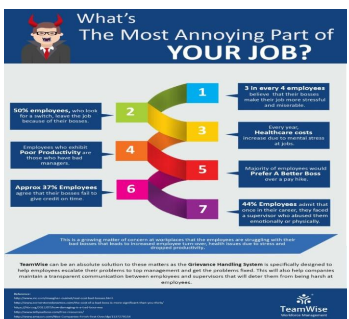
Fig. 2. Empowerment and employee grievances.

Employee involvement and empowerment is discussed in relation to an employee's job satisfaction. It has beneficial effects for employees over the long term, encouraging them to feel more in control and independence and to assume responsibility for continuous improvement and make a positive contribution to the organization. Employee empowerment has a greater organizational value as people join and hope to build their career in an organization. It is essential for employee's sense of job satisfaction to build on initial feelings of empowerment. The effects of employee empowerment can be many for employees. Some are discussed in academic studies of management and organizational psychology, but they also affect their lives. Irrespective of a small business, a large corporate environment or a public agency, people want to influence and participate in the decisions that affect their jobs, and they want to help customers through autonomous decision-making.