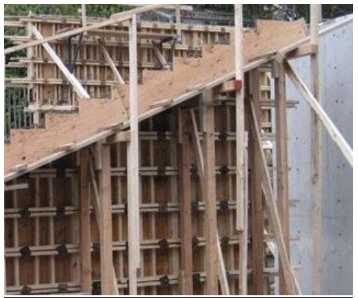
Timber formwork in staircase construction