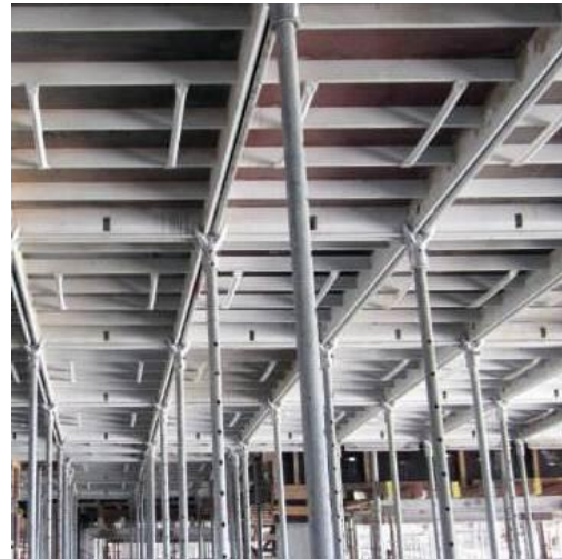
Aluminum shuttering in roof slab casting

Aluminum formwork is similar in many respects similar to those made of steel. Aluminum forms are lighter than steel forms due to low density and this is their primary advantage when compared to steel. The shuttering is economical if large numbers of repeating usage are made in construction. The disadvantage is that no alteration is possible once the formwork is constructed.