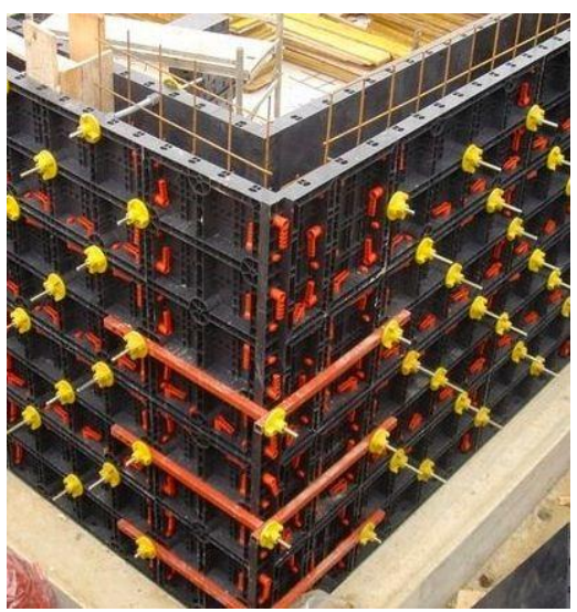
Plastic formwork concrete wall