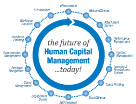
Fig. 4. Ref: 'The ultimate HCM Buyer's guide'

And we have many more software available on the web suitable for performance management system. The future of human capital management system will look somewhat similar to what has been depicted below: