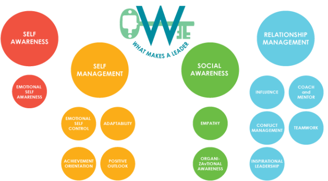
Fig. 1. Skill set for emotional intelligence & leadership.

Emotional intelligence competencies used by outstanding leaders can be assessed objectively, behaviorally—everyone can see it, you know you're doing it. Those are the ones included in the Emotional and Social Competencies Inventory. The ESCI is a 360-degree assessment, meaning an individual completes a survey as do people above and below that person in an organization. Then, the individual receives the information about their own self-assessment as well as the anonymous ratings done by the others.