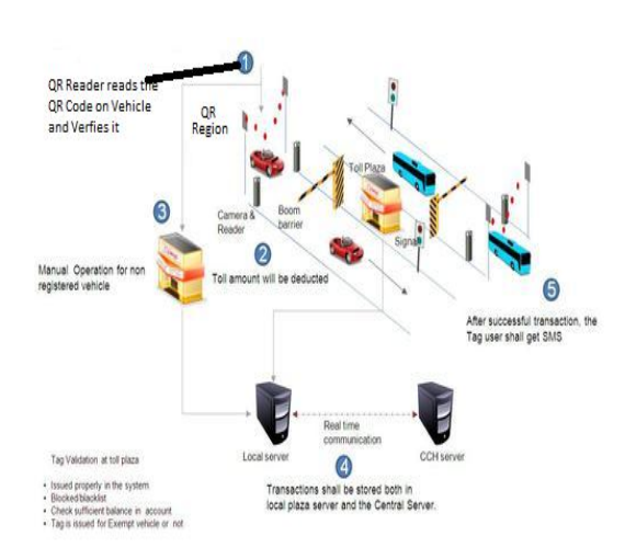
Fig. 1. Working principle

The above architectural diagram explains exactly how this system is going to work. Whenever the Car reaches the nearest point to tollgate the QR reader starts reading the QR Code which is inserted on the Vehicle. Once the QR Reader reads the Vehicle id it will invoke the operation of debiting corresponding money from customer account based on